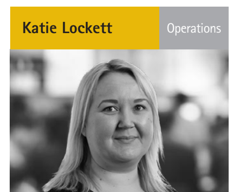
New Business Operations Manager

Underwriter Asset Finance T: 07471 971 275 equinnell@utbank.co.uk