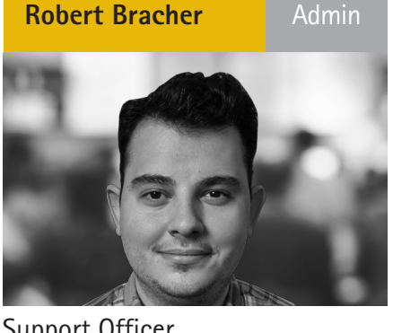
Support Officer Asset Finance